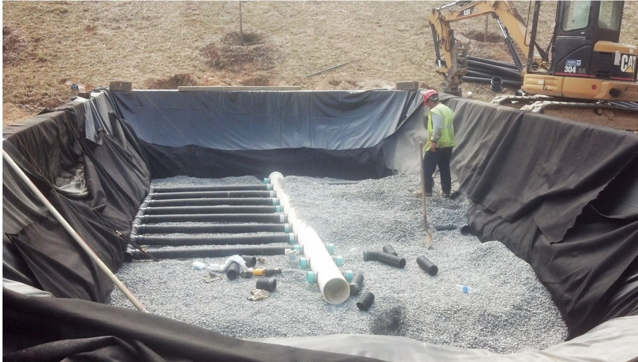
Odorous air bed under construction, to be filled with iron sponge woodchip media for hydrogen sulfide mitigation.